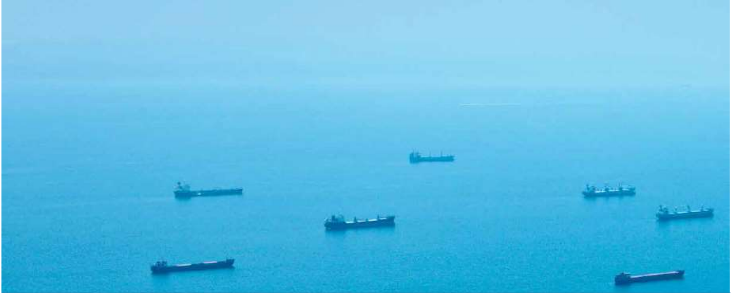
CHART TRACK SHIP MANAGER

Since 1999, Chart Track has been successfully assisting Mariners to sail safely and efficiently.